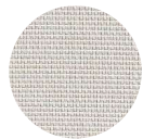
TEXTILENE -51 OFF-WHITE